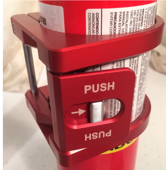
Sector Seven Fire Extinguisher Mount Bottle Clamp Black Left Hand (red)