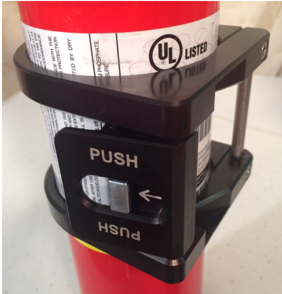
Sector Seven Fire Extinguisher Mount Bottle Clamp Black Left Hand (black)